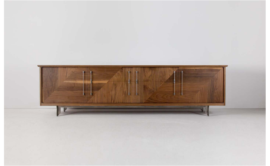
Riley Sideboard Walnut, Burnished Nickel