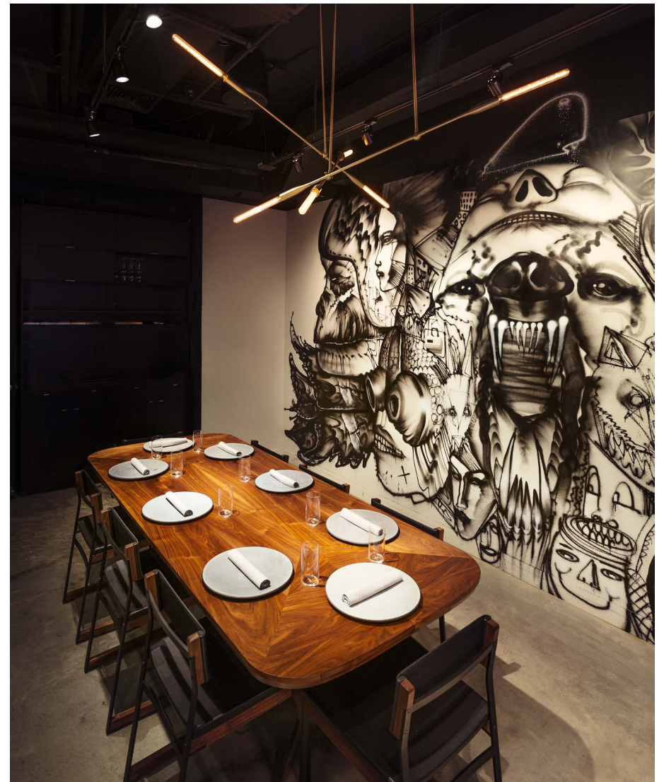
Barnet Table Walnut