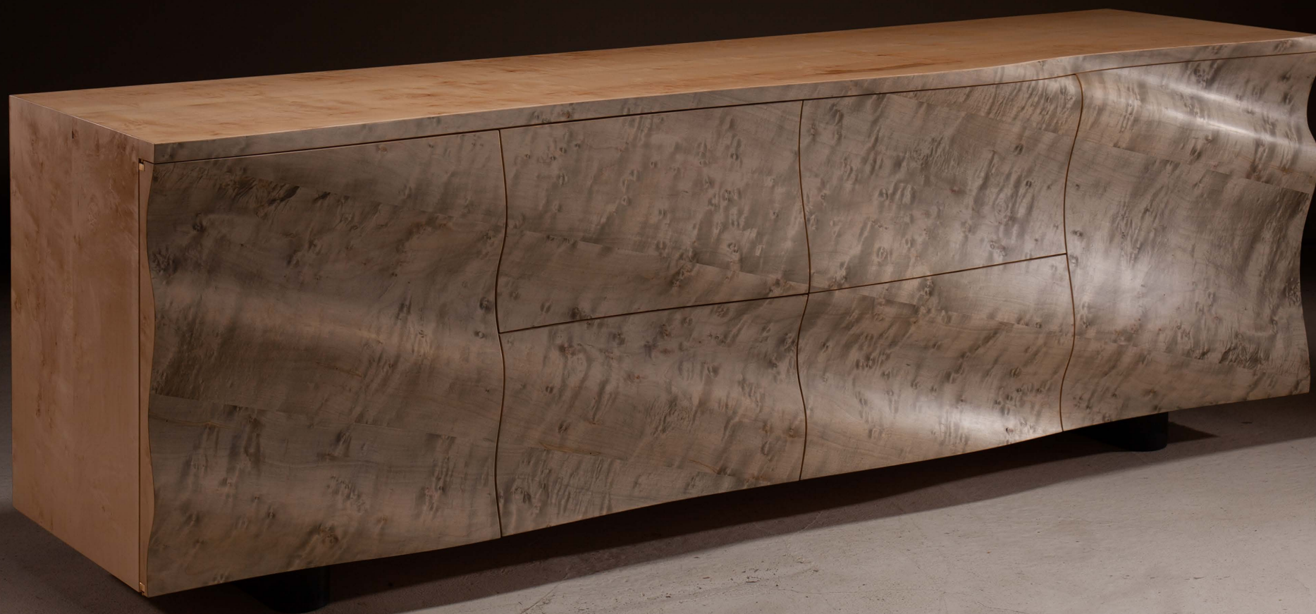
Payette Credenza Figured Maple, Brass