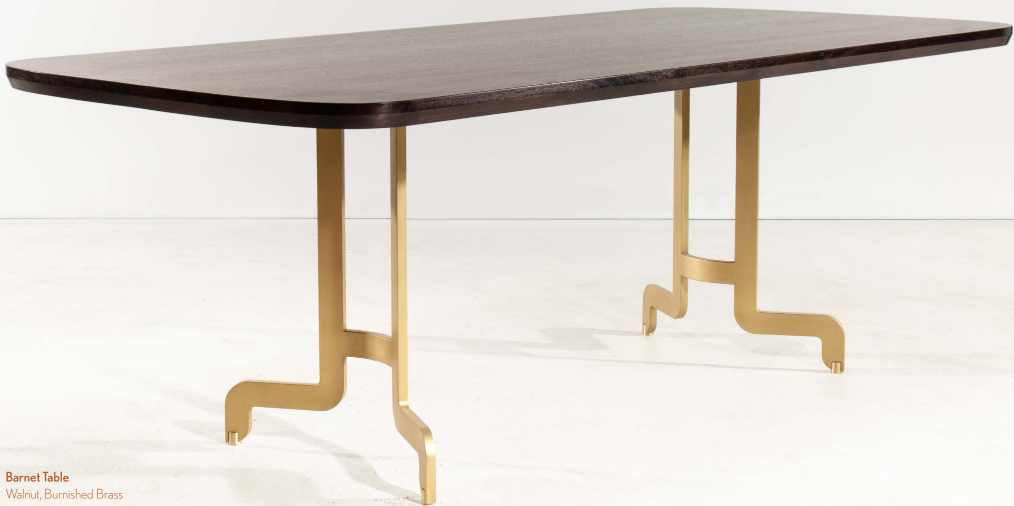
Barnet Table Walnut, Burnished Brass