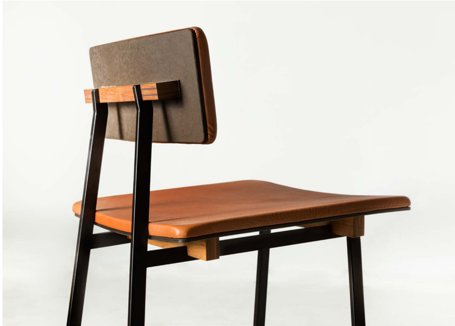
Tea Collection Black Powder Coat, Richlite, Oak, Spinneybeck Leather